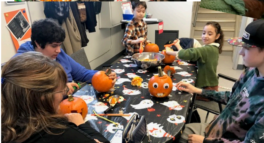
Pumpkin Carving in Cranbrook with K-9